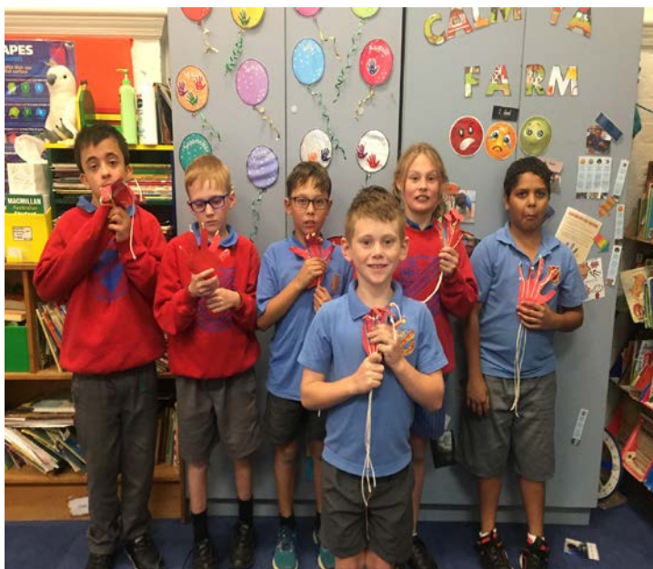
3-6D Bionic Hand STEM challenge